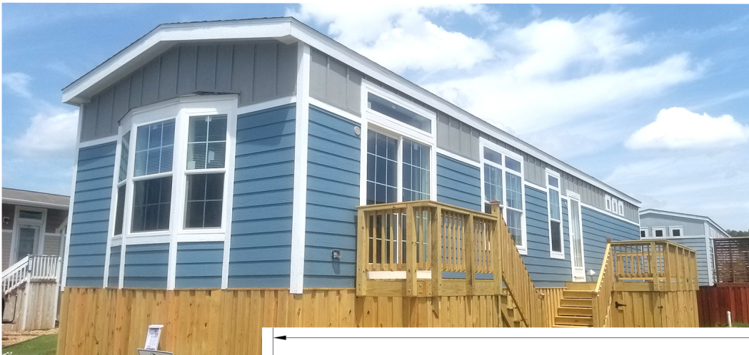
The Lighthouse 2 Bedroom 2 Bath

In lieu of promotion, discount may be taken off the price of the home.